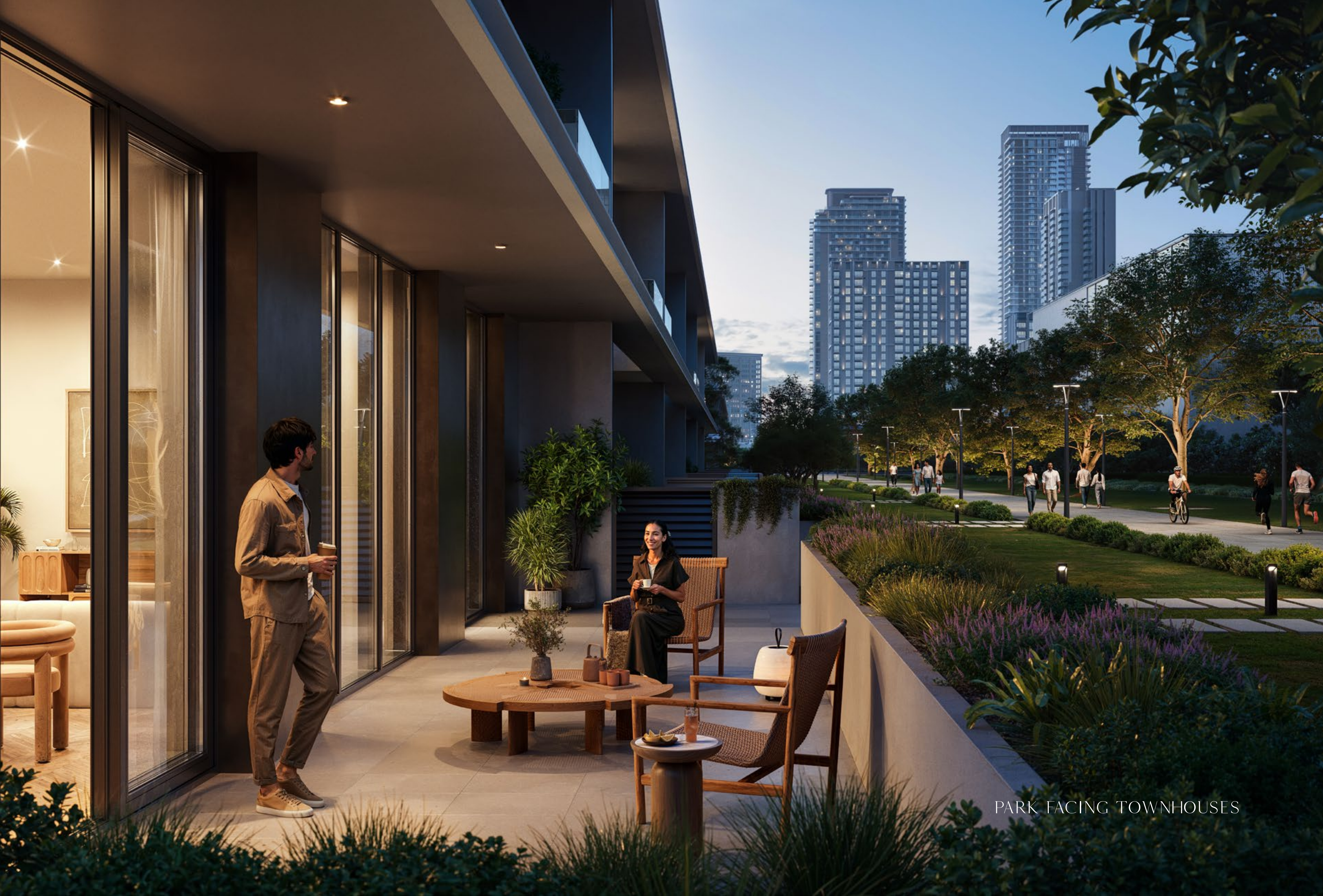
PARK FACING TOWNHOUSES